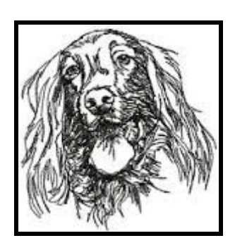
Check me out on www.youtube.com irish setter